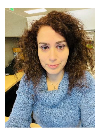
Sonoma County Library IT Programmer Analyst