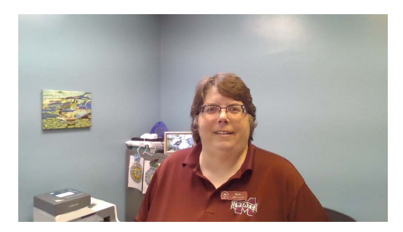
Starkville Public Library