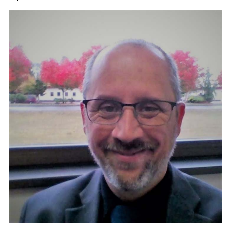
Timberland Regional Library